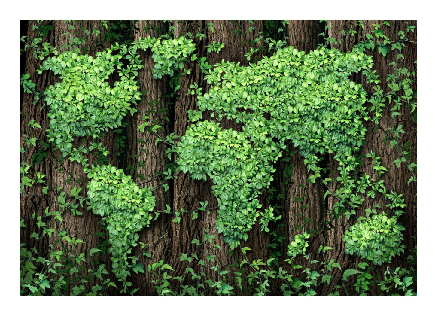
Supported by the Environment and Energy Committee