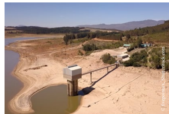
Cape Town , dry reservoirs

While there is no 'one-size-fits-all' solution to enhance water resilience in every city, the CWRA provides guiding principles that enable climate change, natural disaster and extreme event management considerations in decisions. On a broader scale, the City Resilience Index has also enabled us to understand our complex urban systems and develop appropriate plans for strengthening resilience.